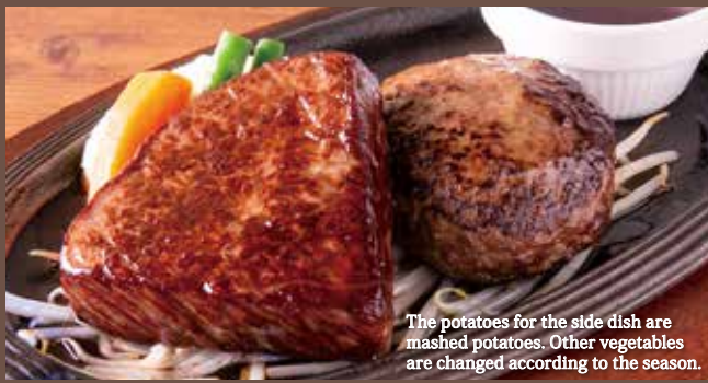
The potatoes for the side dish are mashed potatoes. Other vegetables are changed according to the season.

We recommend and serve steaks medium rare. Please tell us how you would like your steak cooked.